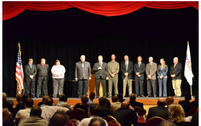
2012-2013 Board of Directors And EXECUTIVE BOARD

We encourage each of you to consider running. Nomination forms are available from ARFFWG headquarters or on the website. Nomination forms must be postmarked by July 29, 2013. All nominees will be allowed an opportunity to introduce themselves, and inform the audience during the Business Meeting on Tuesday, October 29, 2013. All nomination forms will be posted for all to read.